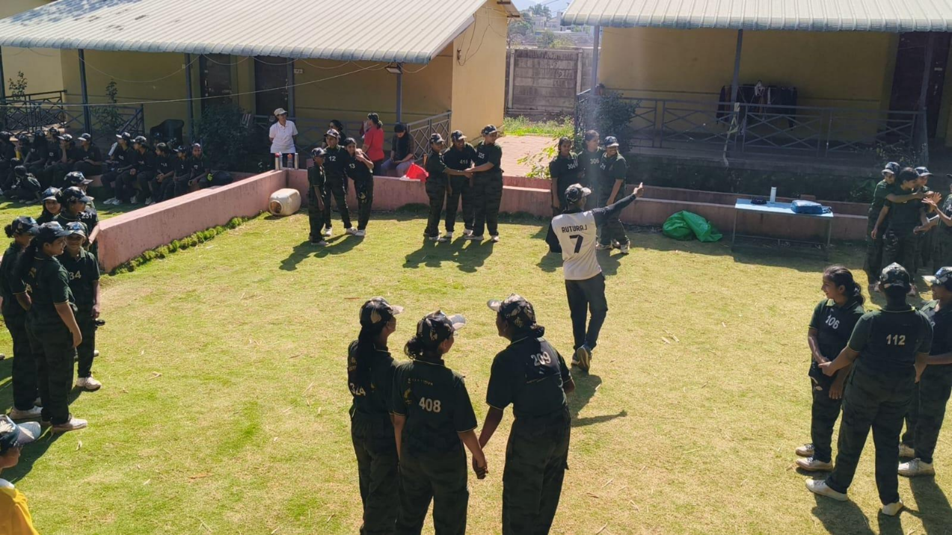
Games During Swimming Place