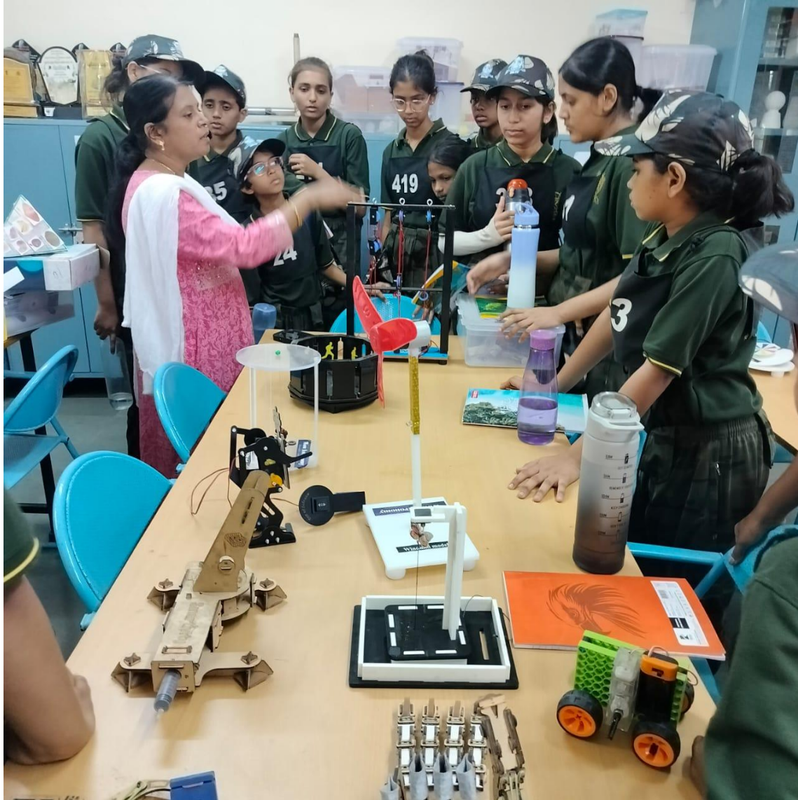
ATL Lab Activity