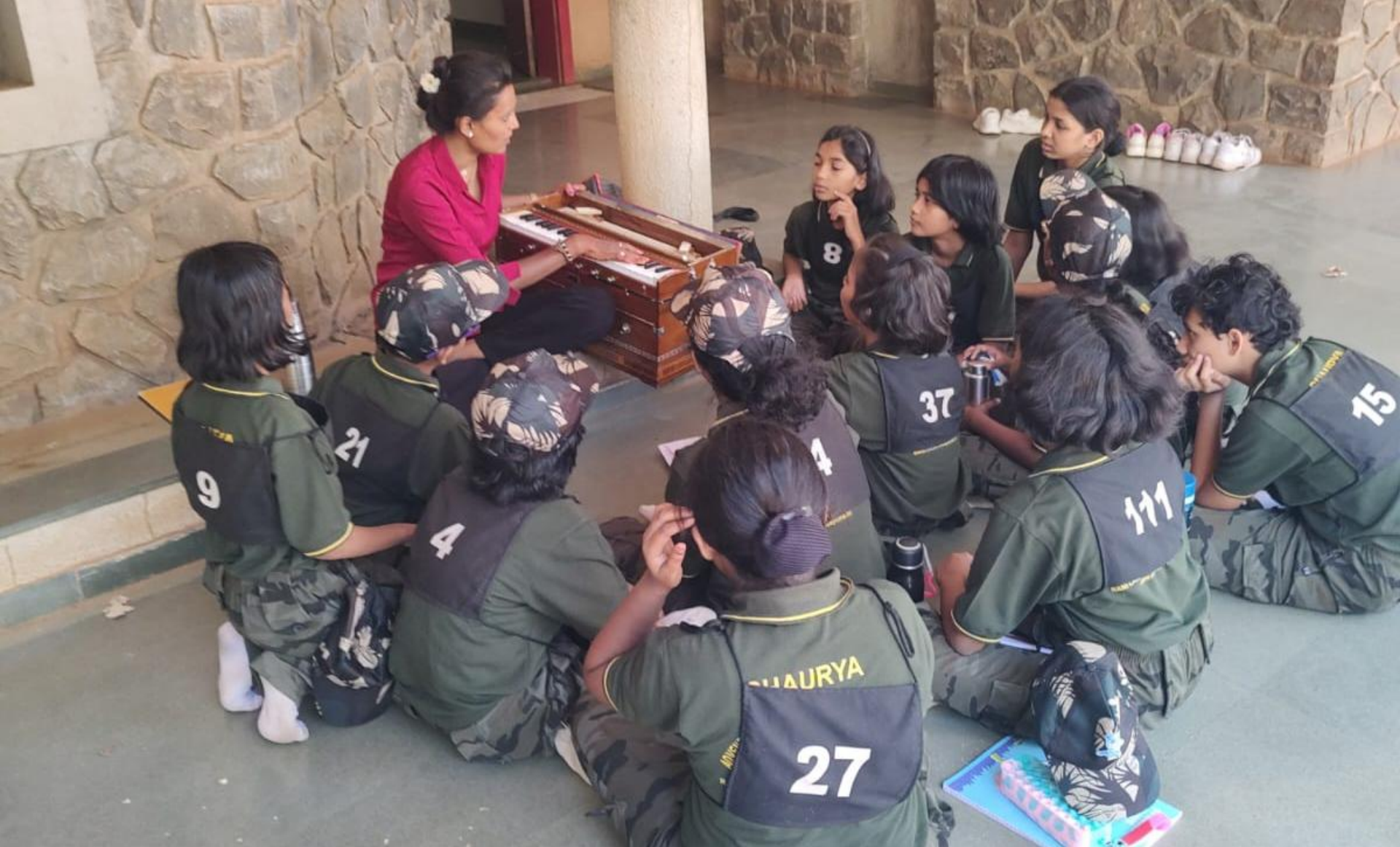
Singing / Music