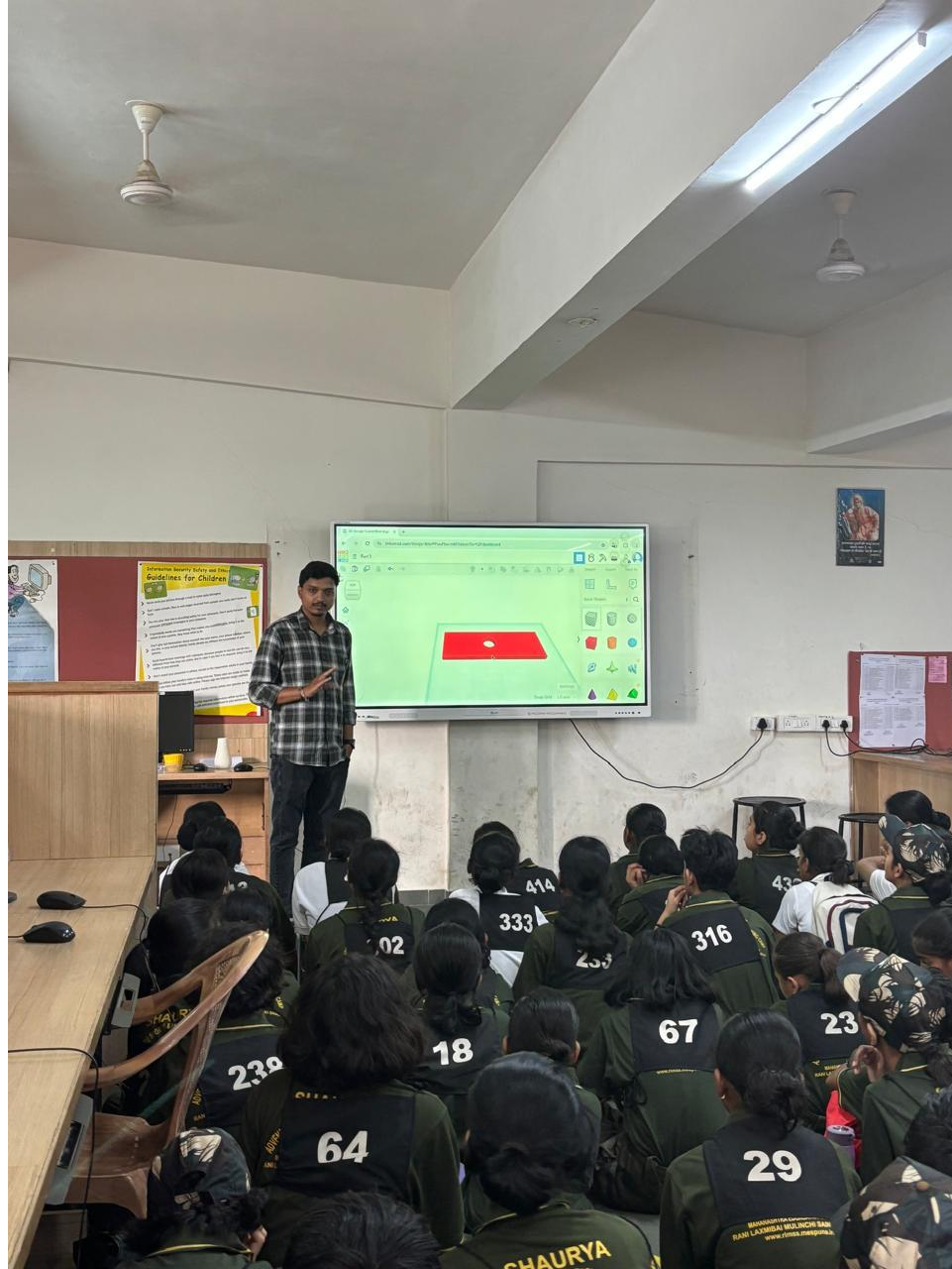
3D Printing Session