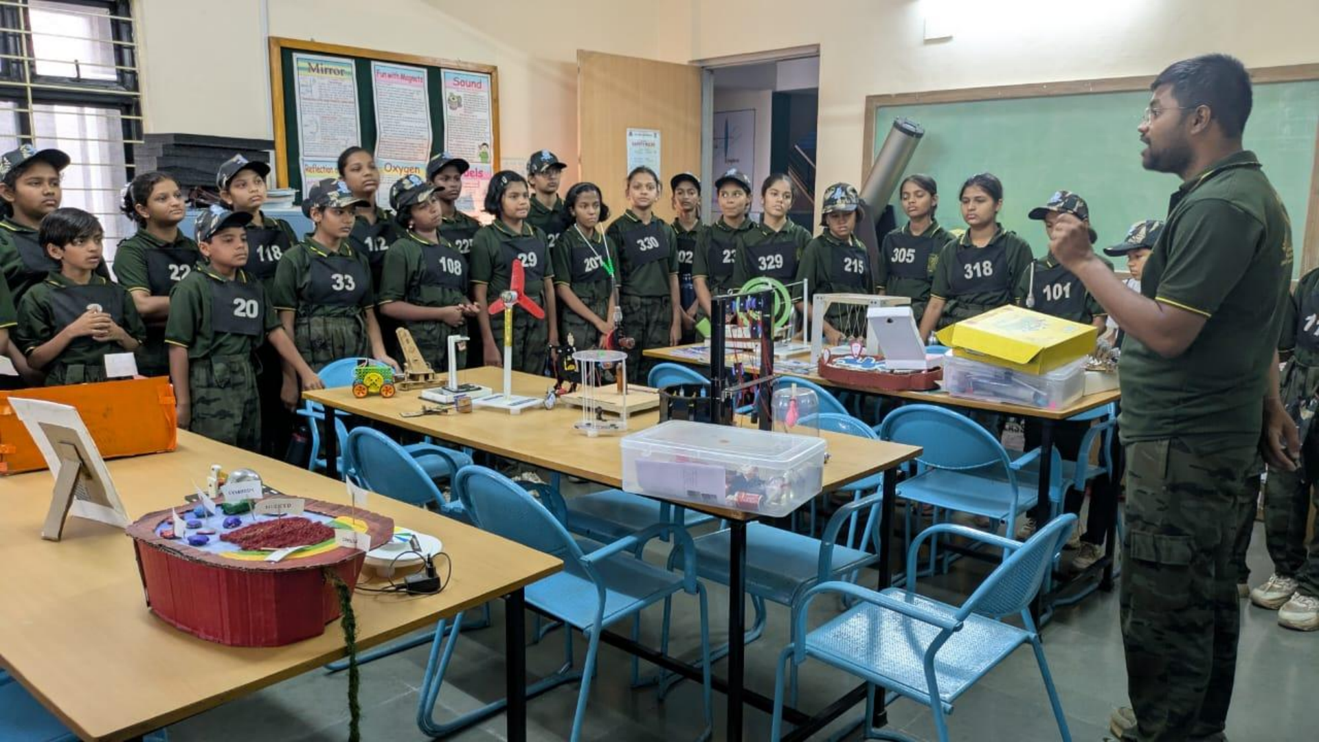
STEM Lab Activity