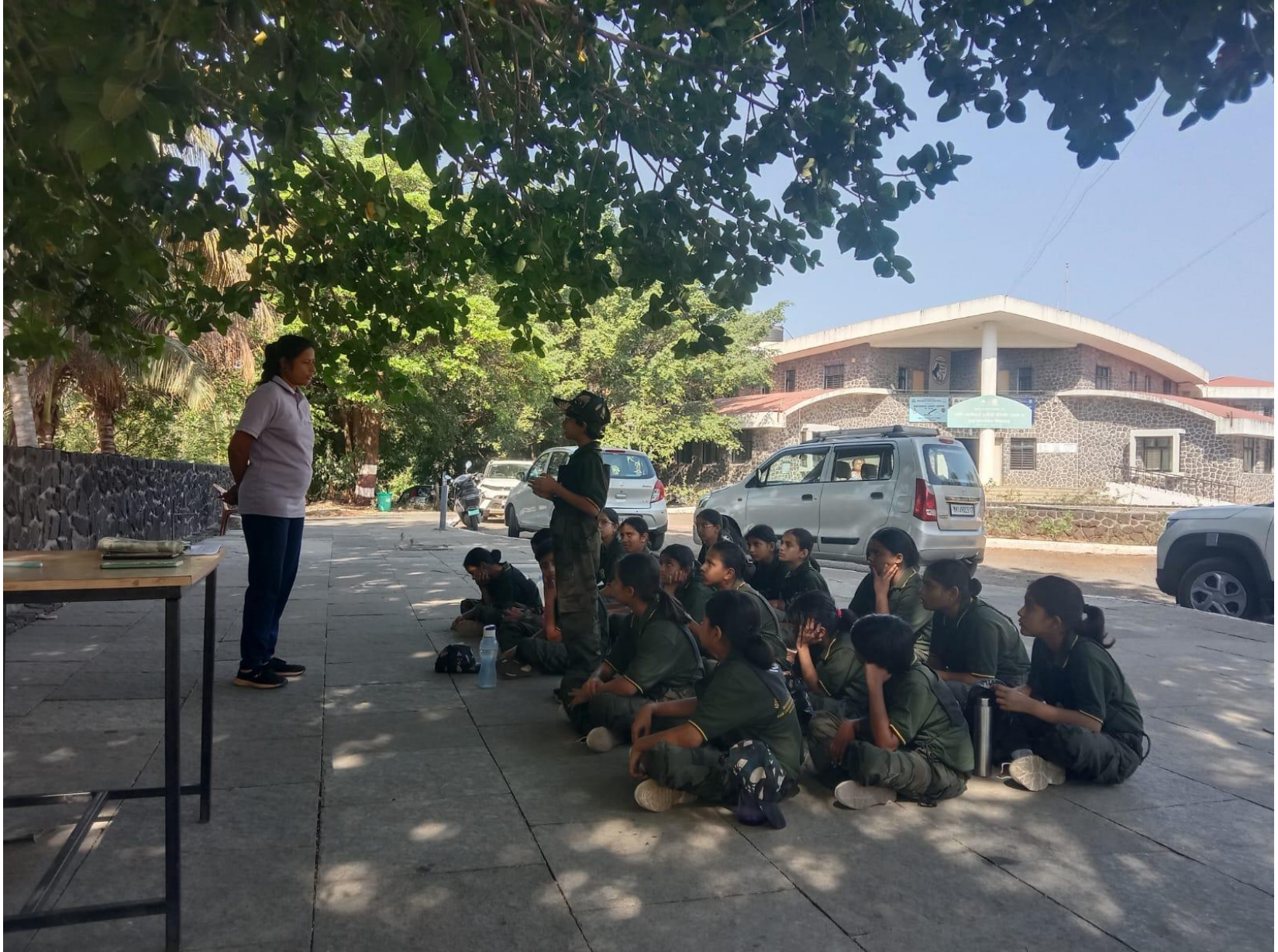
Bharat Scout and Guide