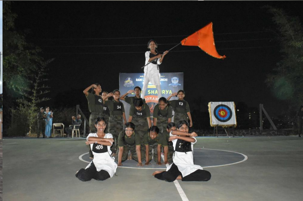
Camp Fire & Manoranjan Program