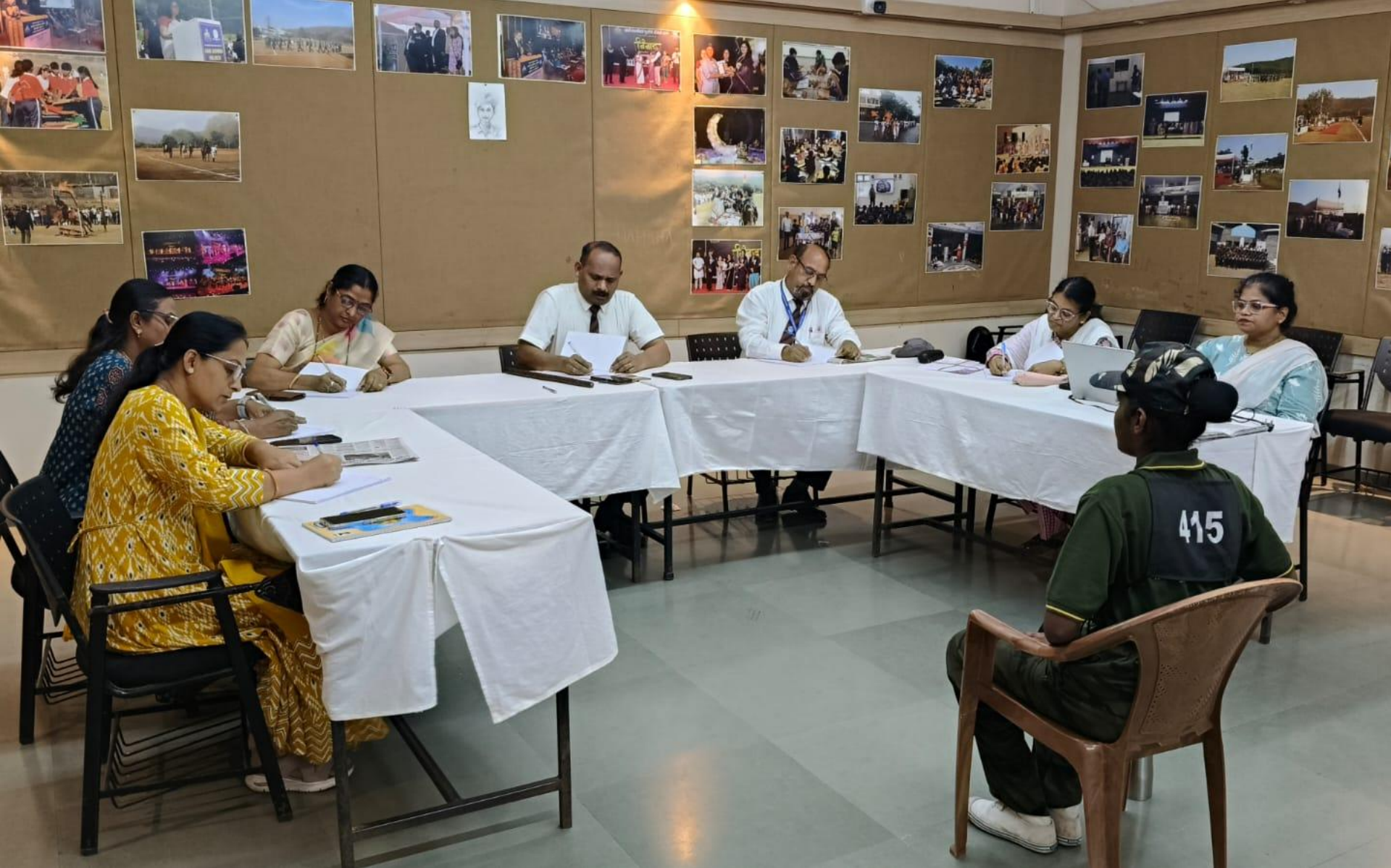
SSB - Interview