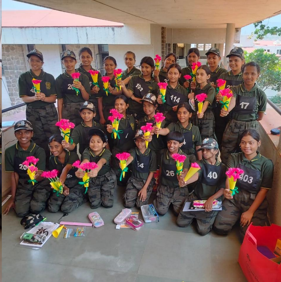
Art & Craft