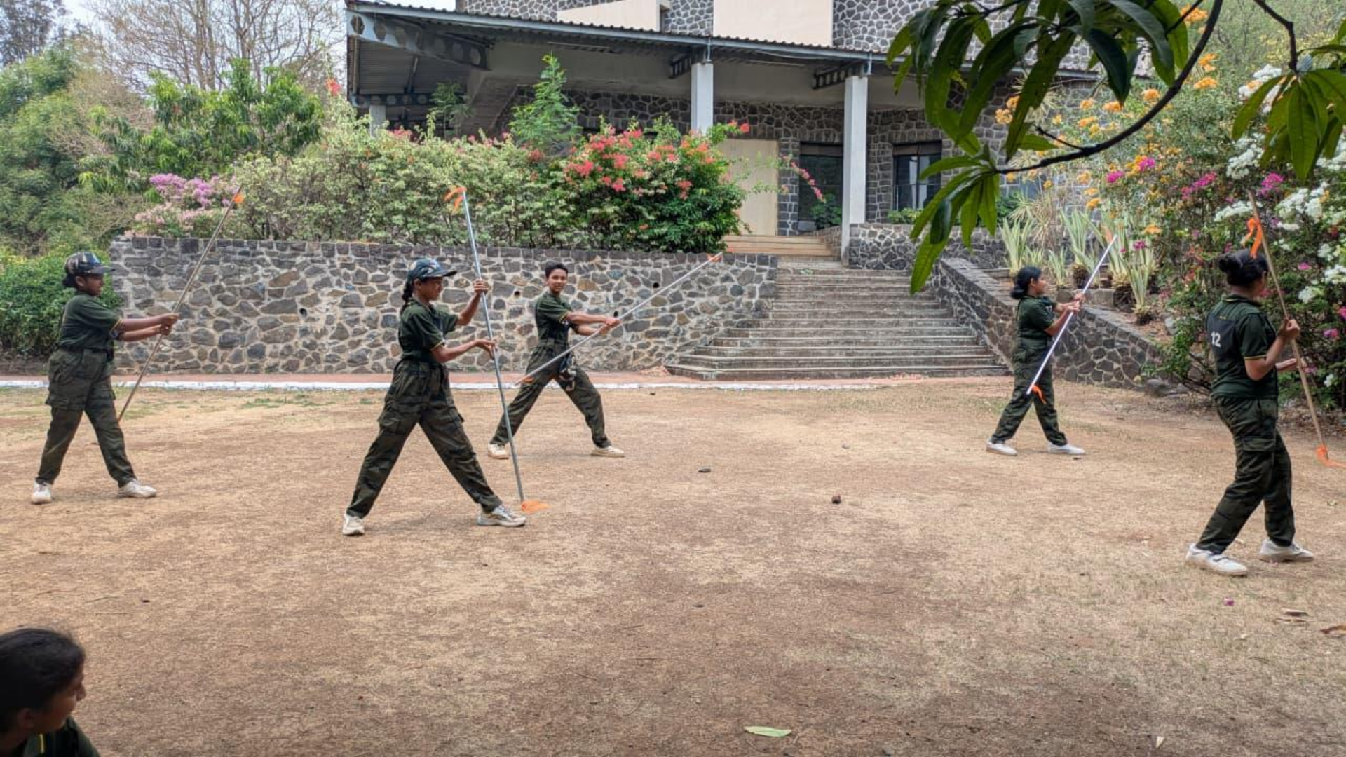
Indian Martial Art - Lathikathi