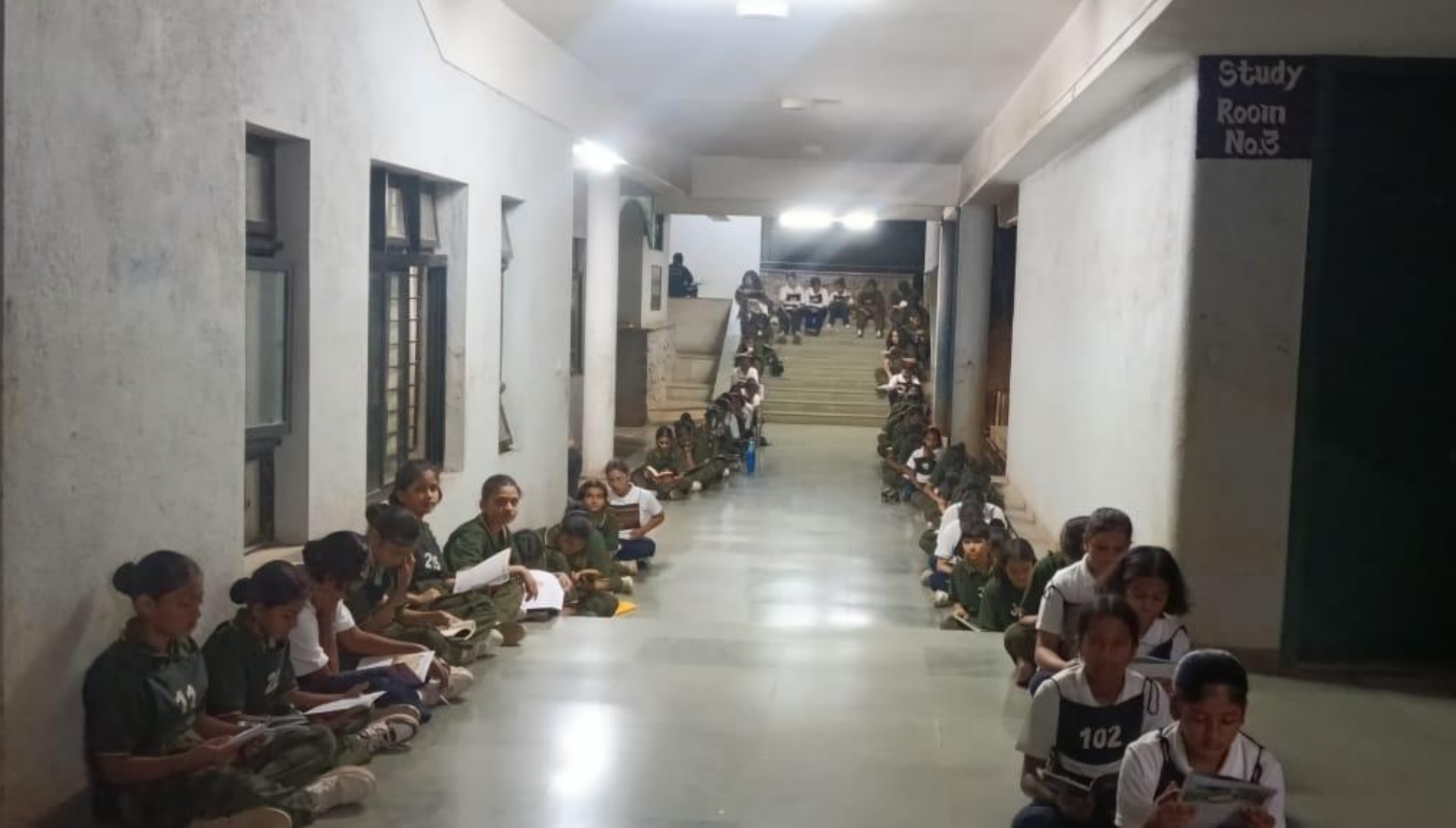
Storry Book Reading